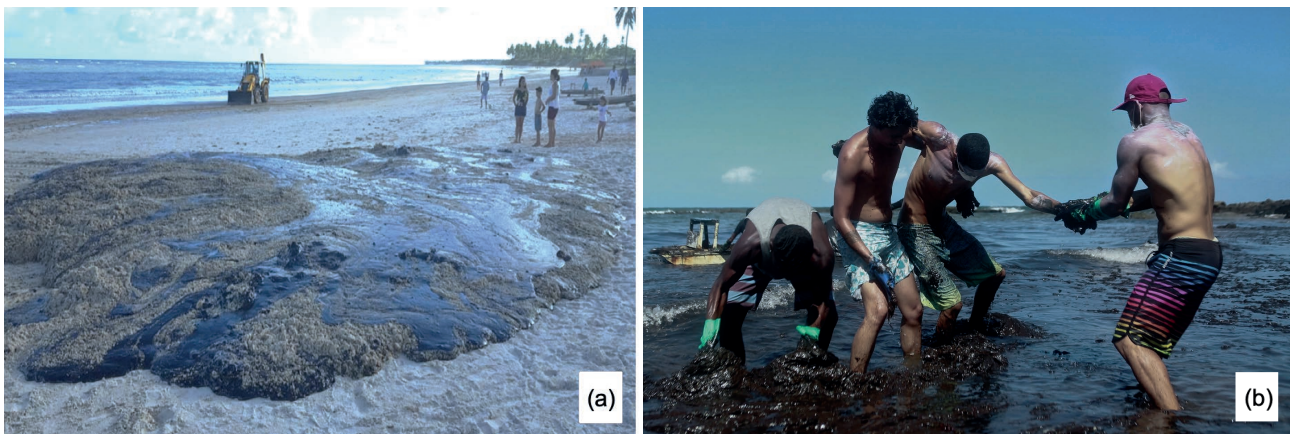
FIGURE 2: (a) Oil spill in Pau Lagoon, in Coruipi (located at Alagoas State), in 2019. (b) Volunteers attempt to rescue young man trapped in the thick layer of oil at Itapuama Beach (located at Pernambuco State).

mobilization of state environmental agencies, city governments, and the Brazilian Navy.