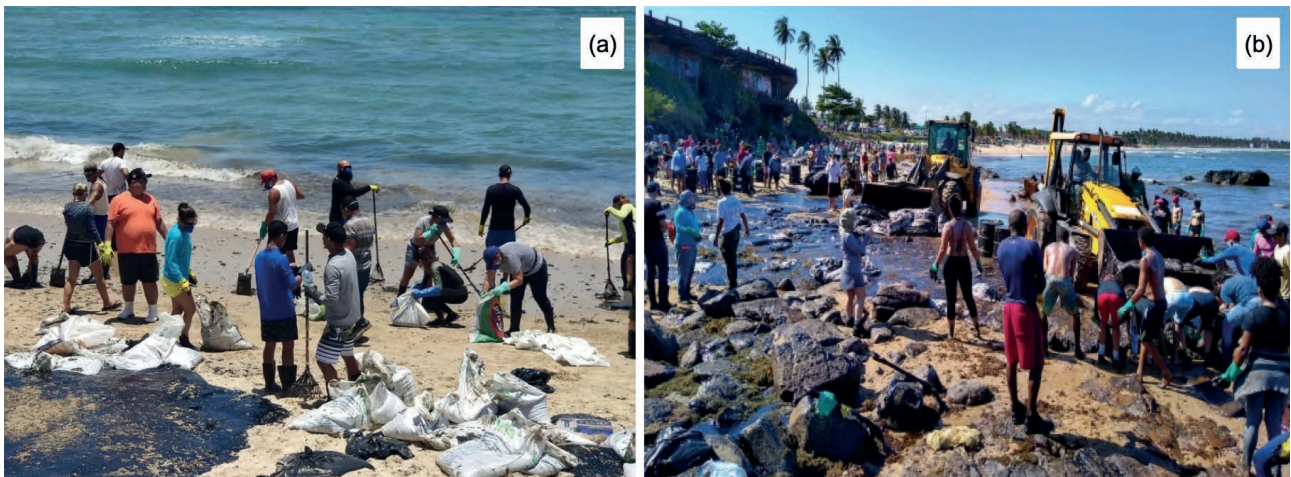
FIGURE 3: . Cleanup carried out by volunteers: (a) Paiva Beach (located in the city of Recife). (b) Itapuama Beach (located at Pernambuco State).

gy for reusing oil waste to produce energy in cement industries was applied as an alternative final destination for waste after the oil spill.