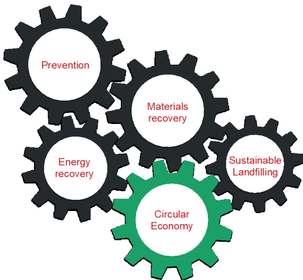
FIGURE 2: Representation of a balanced solid waste management strategy aimed at achieving the functional (environmental, technical and economic) management of Circular Economy.

the triangle makes us lose sight of the virtuous role played by landfill in closing the material loop. Within triangles, materials seem almost to volatilise, to disappear!