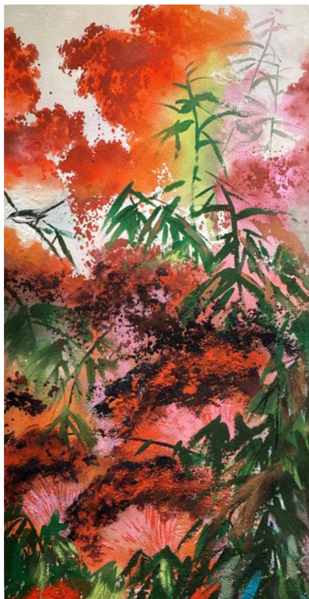
Li Junsheng. Flowers.

The results are amazing. I present 3 examples of very different character. One can only see the grains of sand when you get close to the painting. Amazing how he achieves all the nuances like in an oil painting.