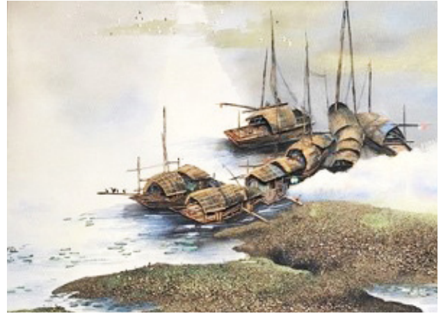
Li Junsheng, Landscape.

These very beautiful sand paintings show the character of the objects in an impressive way. But what has this kind of art to do with waste? Sand and waste wood, plant residues that are also used as materials often become waste. Large constructions may produce a lot of soil without further use in that area. For non-useable sand and other kinds of uncontaminated soils and inert materials the landfill Category 0 was introduced in Europe with different requirements to be met. We experience more often that products suitable for further use like textiles, smart phones and sand become waste often due to non - available users and/or for economic reasons. To find ways for further use of such materials is one of the great challenges we are confronted with in waste management. Sand painting will not solve that problem but may point to it.