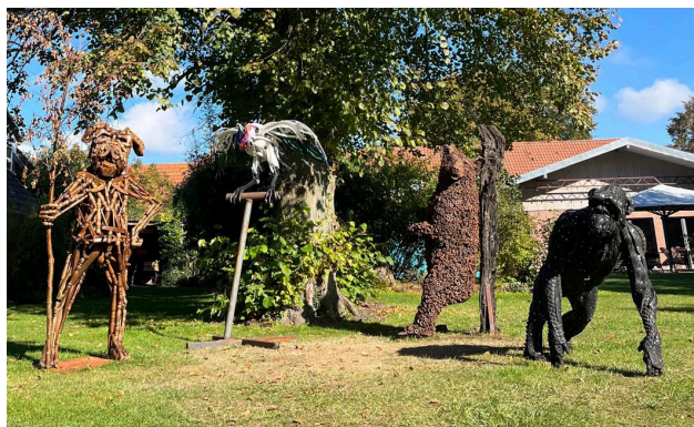
The Guardians of Sustainability.

pressed me a lot because they are devoted to their work. It made me pensive because, in our modern world, many people may have other preferences that are more materialistic. The artists delight us with their outstanding art, clear message of more sustainability, and their ability to make us think about whether our lives are always on the right track. I may return to these artists in more detail in future DETRITUS editions.