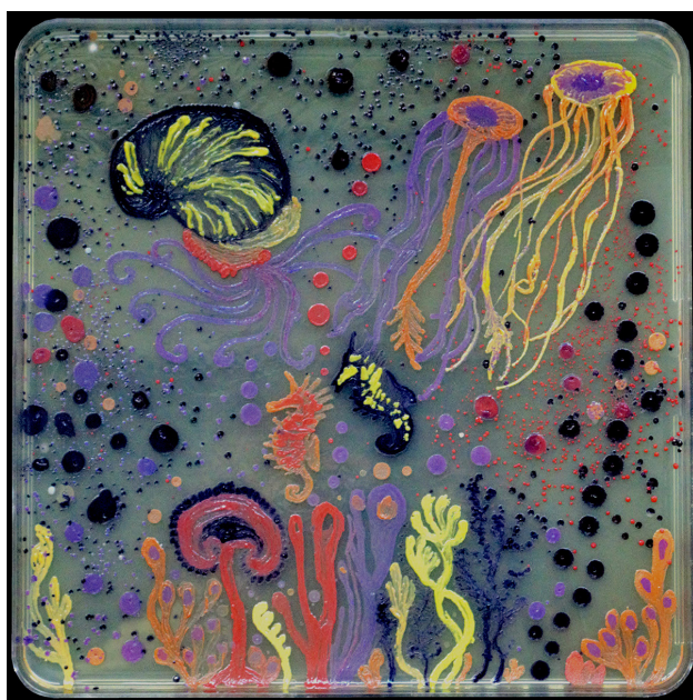
EXAMPLE 1 / Art work from the series Seascapes (courtesy of Dr. Mehmet Berkmen) www.bacterialart.com

I like the analogy that agar plates may be the canvas of the "painter", while the specific bacteria and yeasts rep-