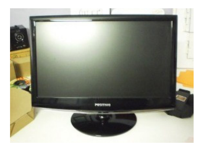
FIGURE 1: Image of a monitor with LCD screen.