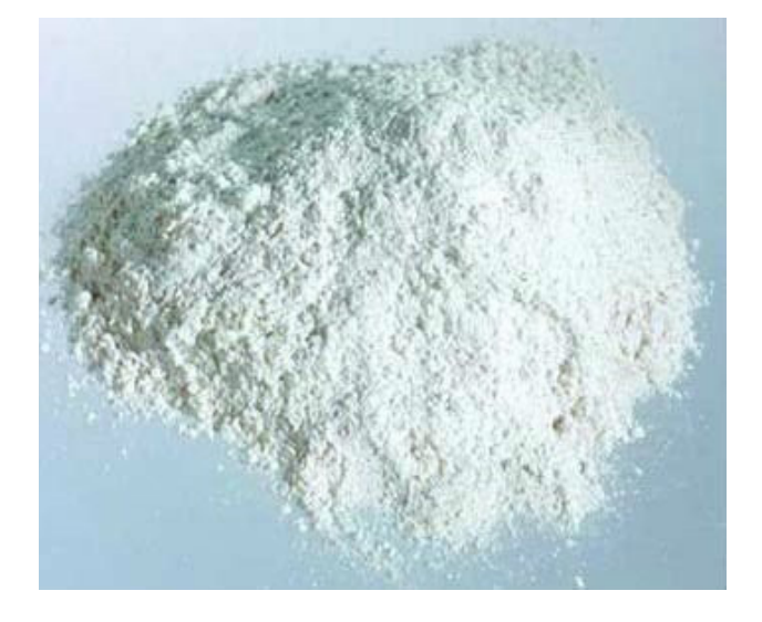
FIGURE 5: Material obtained after milling.

4. The best result was obtained using 6 M HCl at a temperature of 60^{\circ} C and a solid/liquid ratio 1/100, with 298 mg ln/kg, although in general the results were all comparable. On taking into account the economic and environmental aspects, the most interesting result was obtained at the lowest acid concentration (1 M) and solid/liquid ratio of 1/100 and 60^{\circ} C, with 272 mg ln/kg.