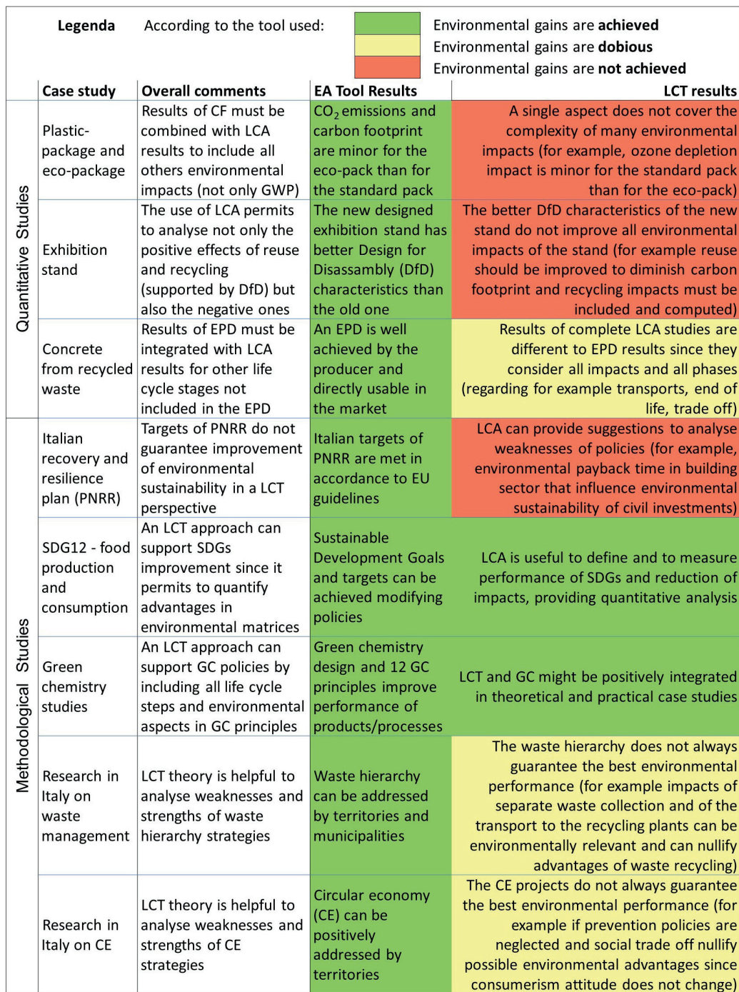
FIGURE 3: Summary of results of studies.

based on an existing Annex of Taxonomy (EU, 2020). This is a clear regulatory commitment to life cycle thinking approach. However, solution proposed by governors to evaluate sustainability of projects seems weak. In fact, neither full LCA studies nor existing LCA research are suggested by EU policies, but only a simplified, streamlined, and integrated approach. Without quantitative results of LCA studies, the risk of bias, subjectivity of choices and greenwashing is very high (Table 1) for policies that claim to be greener than others.