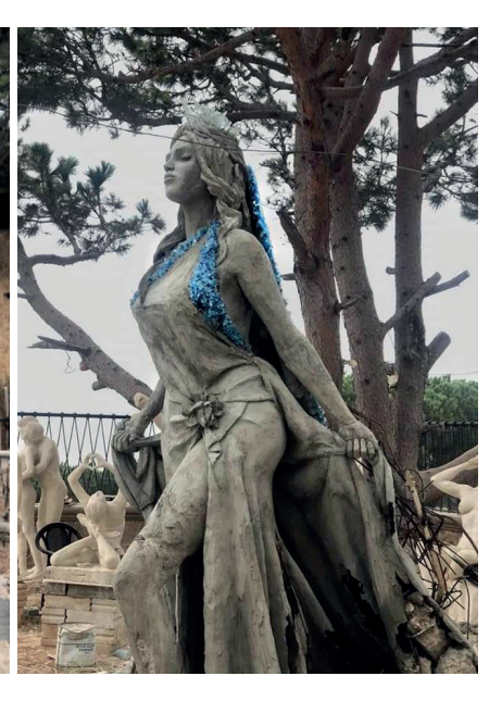
TABCHARANY HANI / "The Bride of Beirut" (Beirut 2020).

In memory of the Beirut port explosion victims on August 4, 2020, and from the remains of the rubble and broken glass resulting from the explosion, the young artist Tabcharany Hani from Gemmayzeh, Lebanon created and sculpted a statue entitled "The Bride of Beirut." The sculpture was made of debris collected from the explosion site, broken glass, pieces of destroyed furniture, pieces of cement, and concrete blocks all collected from the streets of Beirut following the blast. The choice of materials allows the sculpture to be a true reminder of the devastations. The statue has been placed in the centre of Beirut.