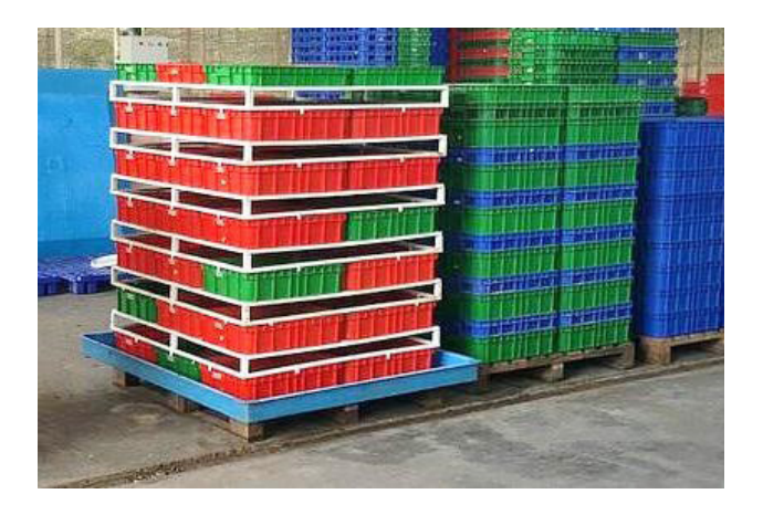
FIGURE 2: Stack of larvero containers with ventilation frames in-between levels (Dortmans et al, 2017).

fish species). In most cases, larvae will need some form of post-processing to ensure they can be sanitized, stored and transported easily to the respective customers. Sanitising involves killing off any bacteria, which might be adhering to the larvae skin and ensuring that the larvae empty their gut which contains only partly digested residue. We recommend dipping the larvae into boiling water as this kills them instantly and sanitizes the product. A storable product requires a water and fat content of below 10%. Sun drying is suitable to reduce water content and the fat content can be reduced using an oil press. The waste residue has similar characteristics as immature compost and therefore requires post-processing. Composting the residue is the simplest approach, but an alternative is vermicomposting or adding it into an anaerobic digester.