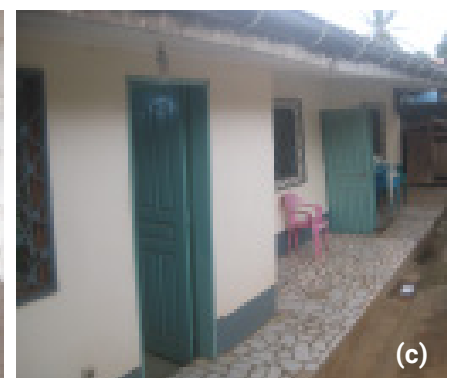
FIGURE 3: Different phases of the literary cafe: a) the project (courtesy of arch. Rosalba Giani), b) the restoration works, c) the realisation