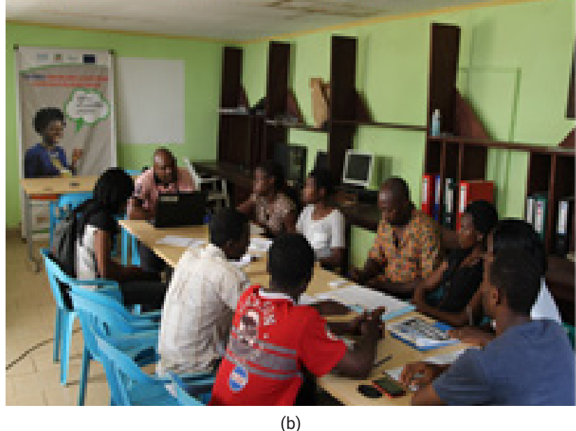
FIGURE 4: Event organised in the literary café, (a) and typical final report used as follow up document (b).