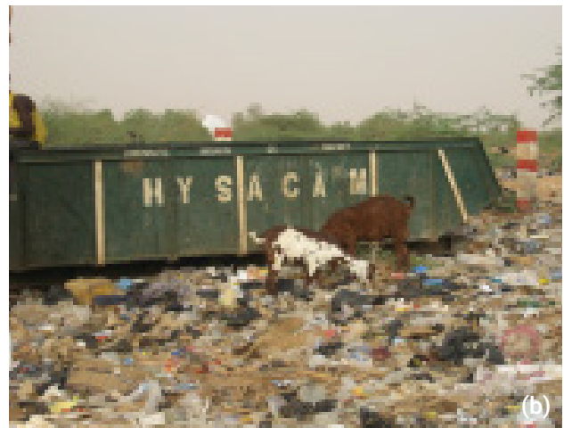
FIGURE 1: Waste in Yaoundé: a) in a poor neighborhood; b) along a main road in town.