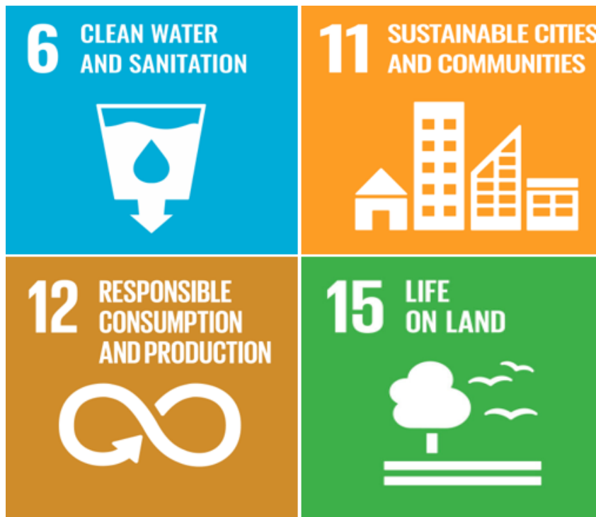
FIGURE 2: SDGs promoted through the utilization of wastes as soil stabilizers.