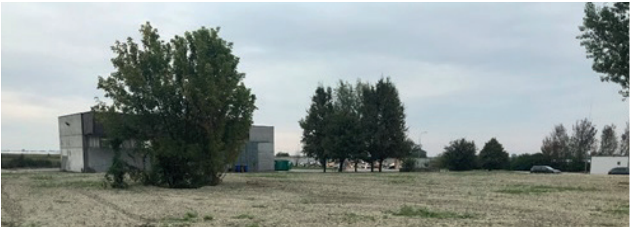
FIGURE 8: The area at the end of LFM

The Investigations which ended in 2014, concerned: