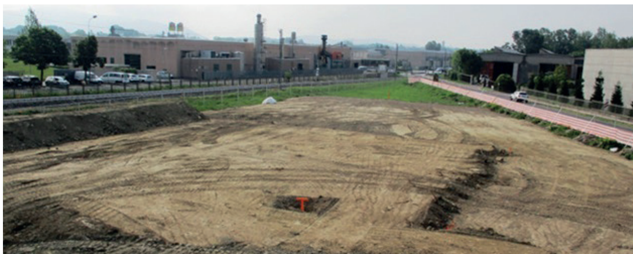
FIGURE 12: The area at the end of LFM.

This creates a distrust for EoW with a resulting difficulty in finding a market.