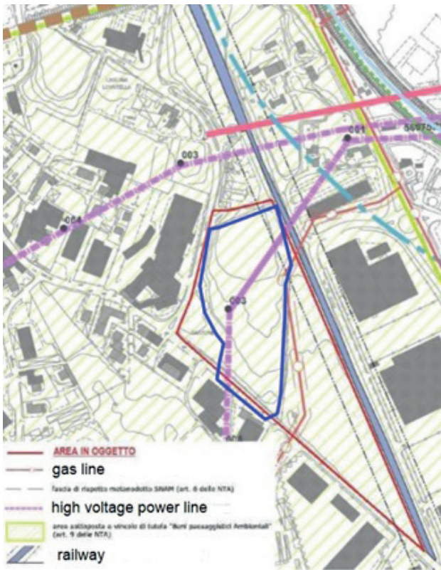
FIGURE 11: The area of intervention (in red), the landfill (in blue) and the facilities.

of average. The minimum quota of waste is at 267,00 m a.s.l. and the groundwater is at average 265,5 m a.s.l., with a seasonal fluctuation of +/- 3.5 m. Before the disposal of waste, the ground has been regularised and the slice of depression have been covered with 30 cm of clay.