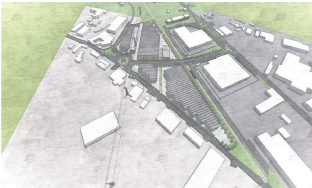
FIGURE 10: Rendering of the future configuration.