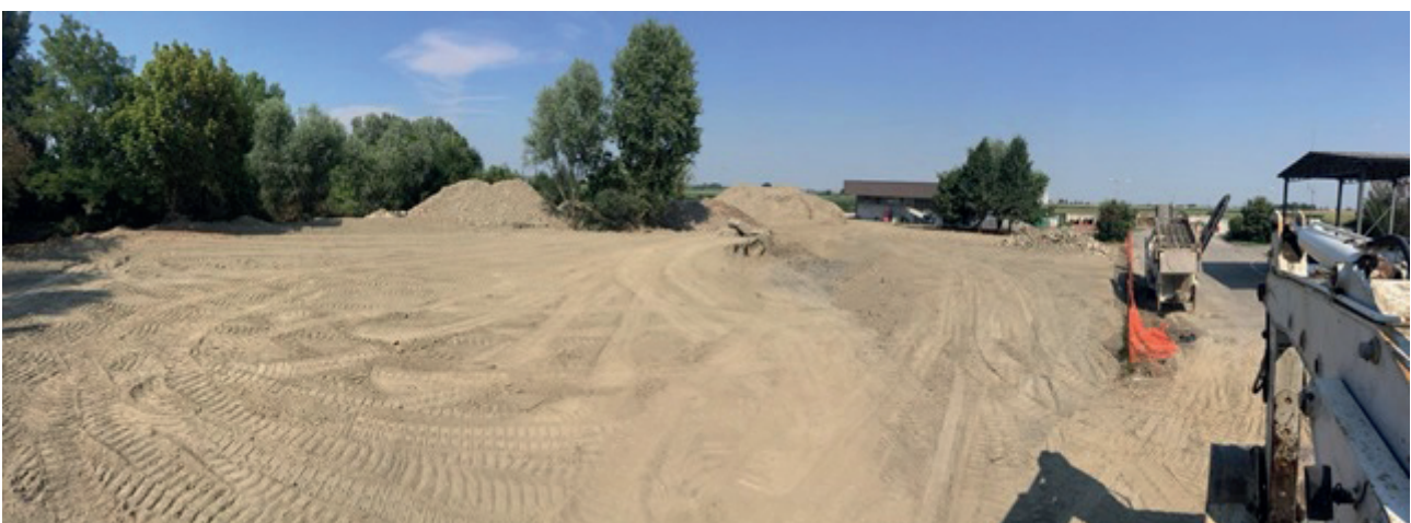
FIGURE 6: The landfill area before LFM intervention.

The green area has never been used, the other portion was a gravel pit in the '60, a motocross track from 1970 to 1989, a landfill from 1993 to 1996. The landfill area is in banking, on the contrary the other portion is in the depression; this means that a morphologic rearrangement is needed.