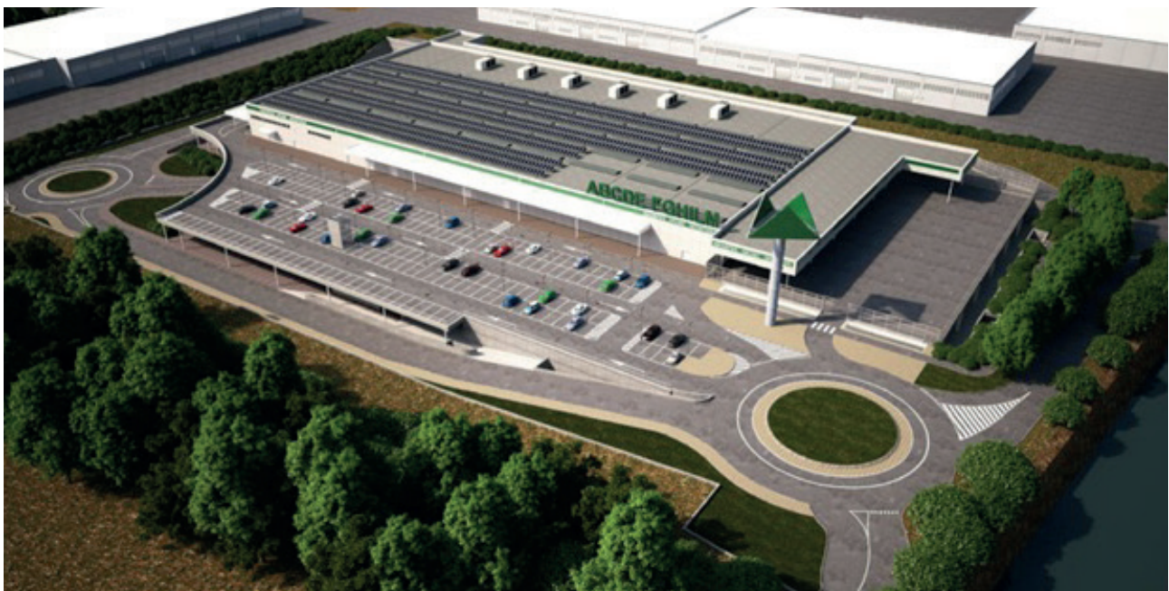
FIGURE 2: Rendering of the future configuration.

Available data is limited but this is an interesting case because the LFM activity is key to the realisation of a high-speed railroad and it includes only the removal of landfilled waste along the railway line (about 50.000 m 3 ). The dump was in operation from 1987 to 2009, regularly authorised. LFM will concern more or less 50% of the total volume of landfill. The portions not affected by the removal will be