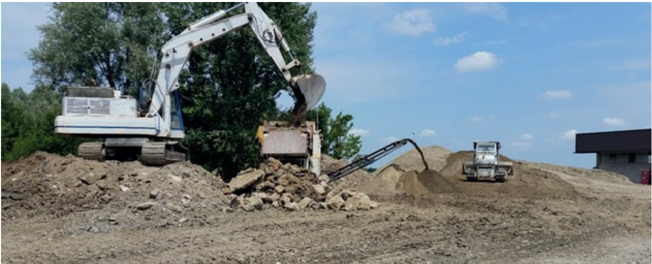
FIGURE 7: The shredder and the different grounds sorted.