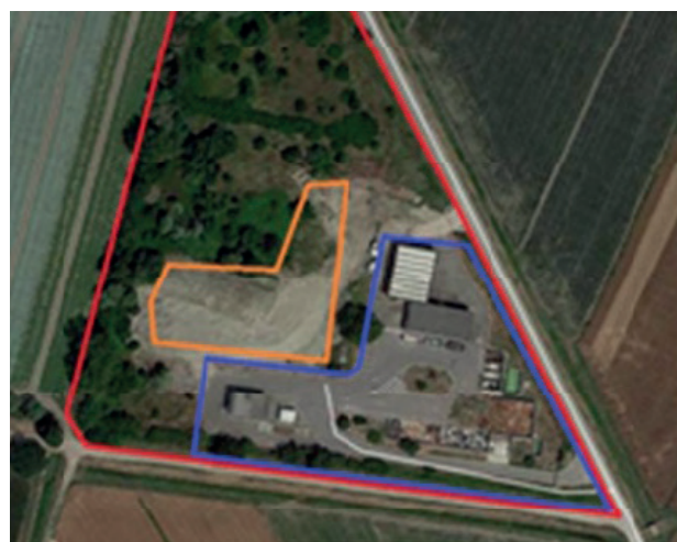
FIGURE 4: Landfill (in orange) and municipal collecting plant (in blue)