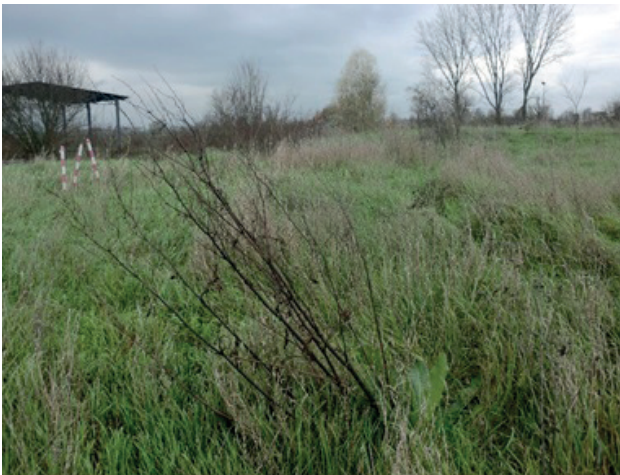
FIGURE 5: The landfill area before LFM intervention.

by the operators or with the assistance of a supplied mechanical tools (excavator bucket); this waste will then be identified and managed under a temporary storage regime, with storage in heaps and delivered to authorized facilities for subsequent recovery/disposal;