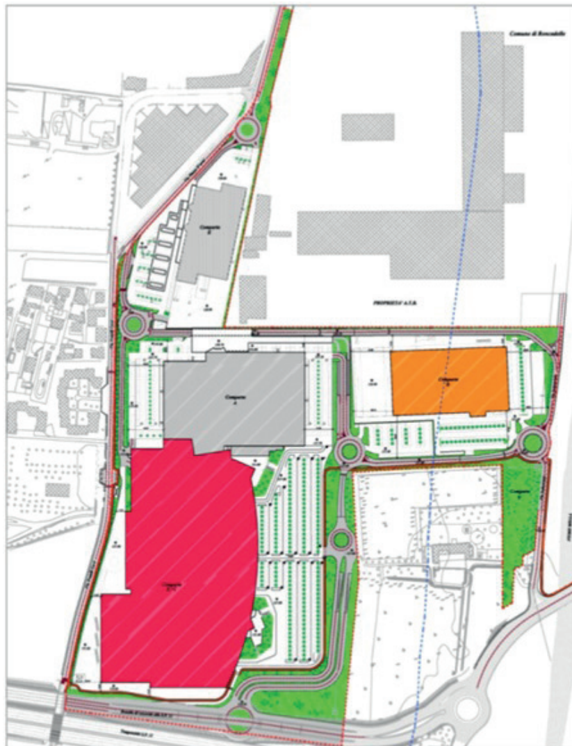
FIGURE 1: The "Mella 2000" project *.

With regard to the delimitation of removal operations, it has been taken into account that the area of intervention is characterized by multiple presences of sub-service lines (traced high voltage power line Terna; high-pressure meth-