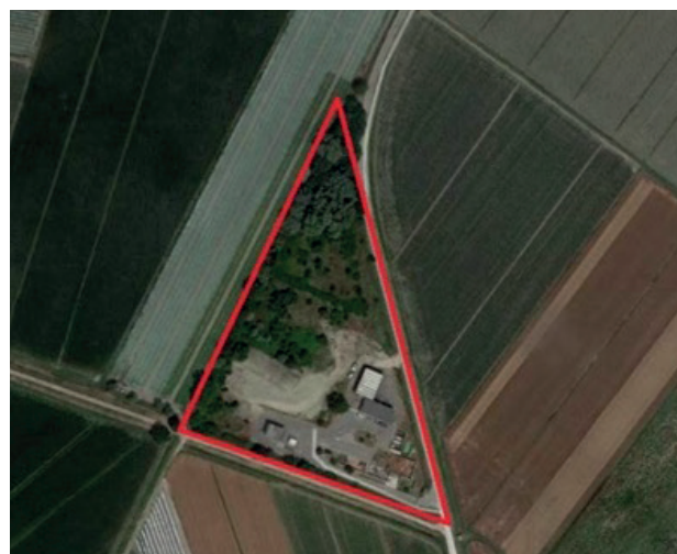
FIGURE 3: View of the dump and the plant.