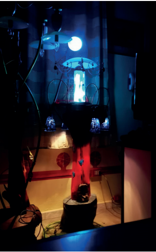
FIGURE 1: The light sculptures created by Ugo Matzuzzi.