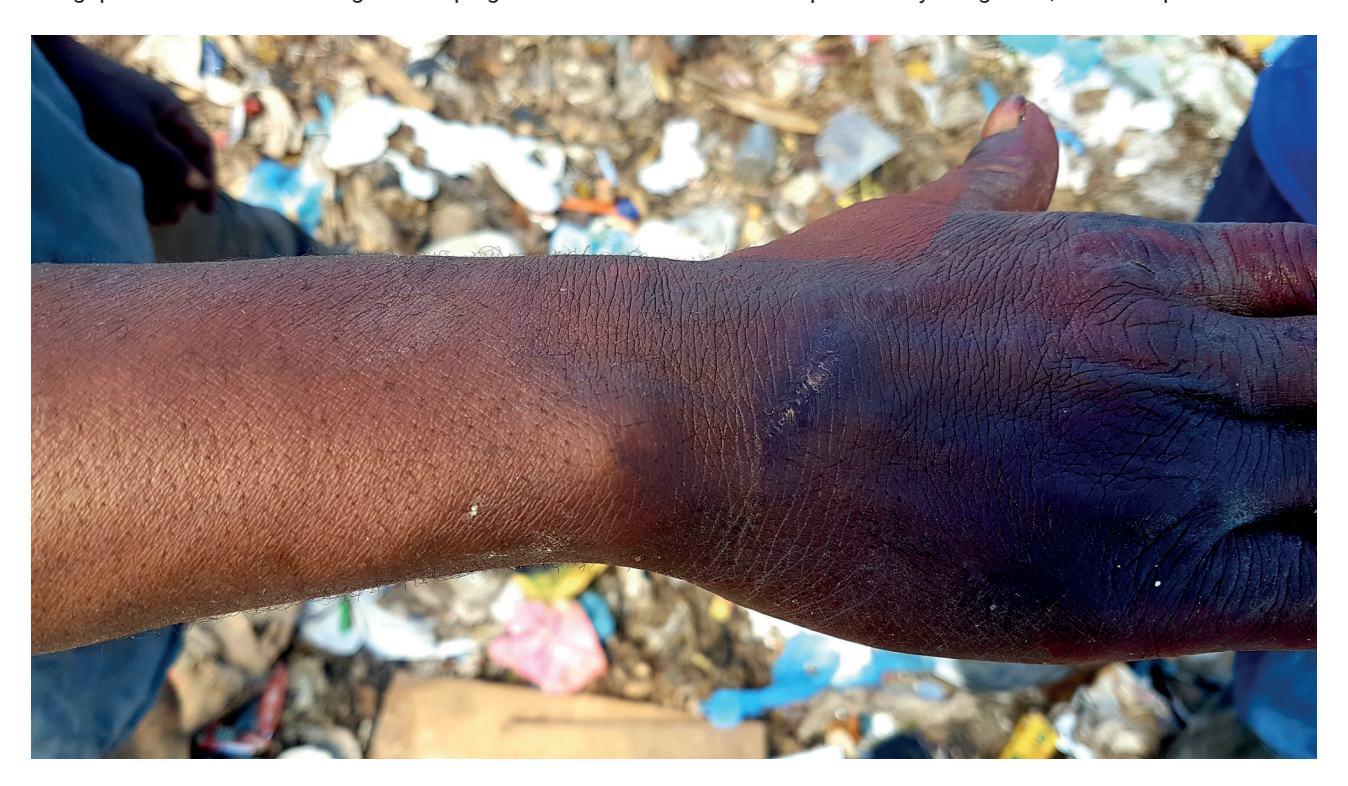
FIGURE 4: An IWP shows a scar caused by broken glass at Mzedi (Kalina, 2019).