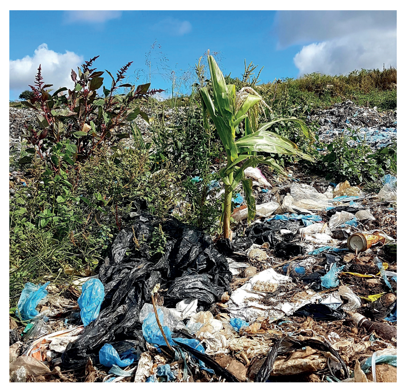
FIGURE 5: Maize plant growing near the centre of the original dumping area (Kalina, 2019).

cited by IWPs as the most persistent environmental hazard encountered at the site, more so because they are forced to frequently handle or sift through waste without the use of gloves or other personal protective equipment. Most IWPs, displaying scarred hands and feet, described injuries from glass as frequent occurrences that often required trips to the hospital or necessitated them missing periods of work to allow for healing (Figure 4). Another waste item around which problematisations have formed is old food, with some IWPs believing that consuming food waste found at Mzedi could cause illness 29. However, this problematisation was not universally held, as many reported happily taking old food, either to eat at home or to feed to livestock. Similar problematisations have formed around medical waste, though few IWPs described encountering the needles and other sharps objects described by the