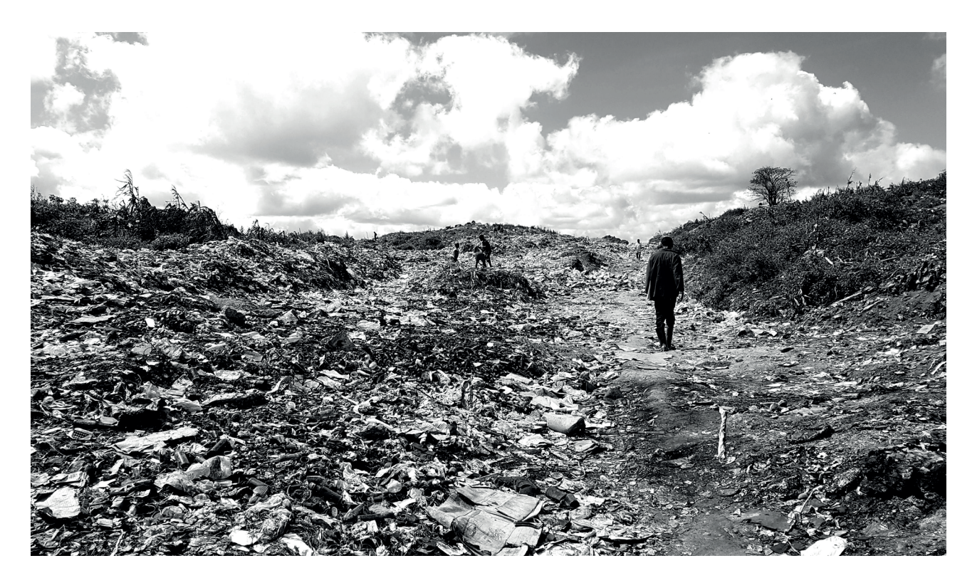
FIGURE 2: Primary access road to Mzedi dumpsite; maize and unauthorized trash dumping are visible along the sides (Kalina, 2019).

main site becomes inaccessible (Figure 2). Unfortunately, this deterioration is expected to continue, as the city lacks both the funds and the heavy equipment to clear the road or conduct necessary upgrades to the site. Looking forward, city officials pin their hopes on the construction of a new