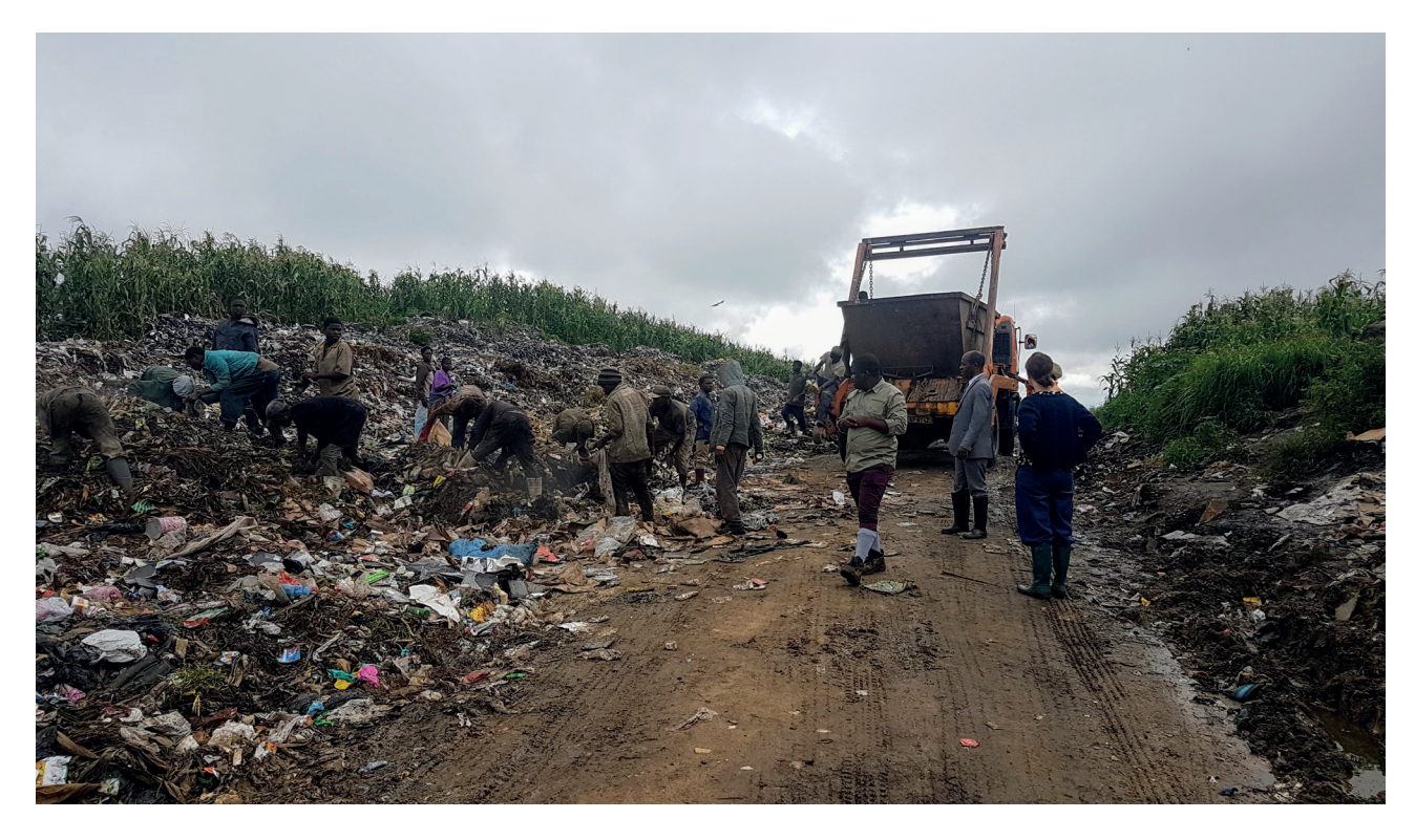
FIGURE 3: IWPs Access Waste Dumped Alongside the Access Road (Kalina, 2019).

This study was conducted in tandem with Kalina et al. (2019), which sought to understand both the real and per-