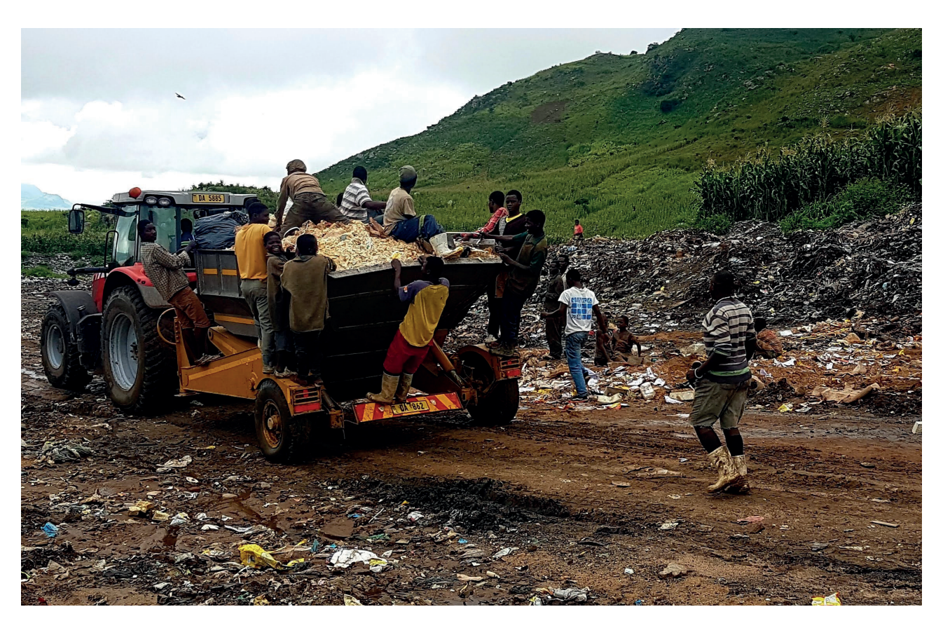
FIGURE 6: IWPs ride a new delivery into Mzedi (Kalina, 2019).

a few who have fallen under the wheels of the tractor, the result has been fatal. Although both sides regret the loss of life, there is a clear distinction in opinion in where the blame lies, with the city problematising the behaviour of the waste pickers as unsafe and reckless, while the IWPs criticise the city and the tractor drivers for not considering their safety or their livelihood needs <sup>32</sup>.