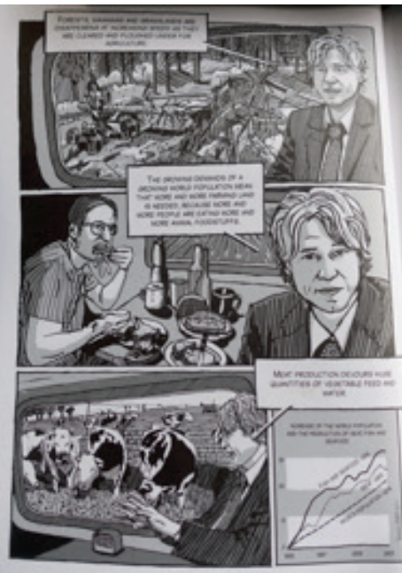
FIGURE 1: The Great Transformatiom, Climate - can we ban the heat? (Anonymous, 2014).

obtained through cooperating in this project.