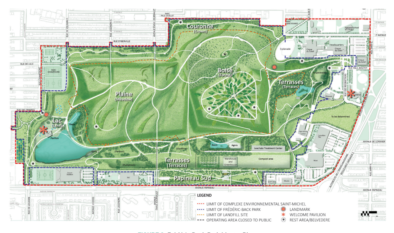
FIGURE 2: Frédéric-Back Park Master Plan.

Since 1996, collected LFG is compressed and burned in a power plant to produce electricity. At first, technology used consisted of a boiler, a steam turbine and an alter-