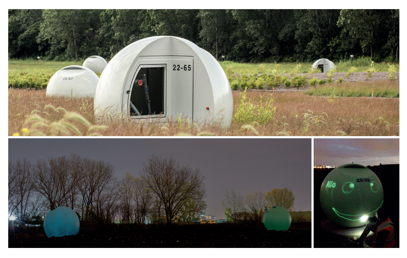
FIGURE 10: The spheres are designed to protect the LFG collection wells and make part of the park experience.

Ash trees attacked by the emerald ash borer and cut down by the City of Montreal are retrieved, planked and