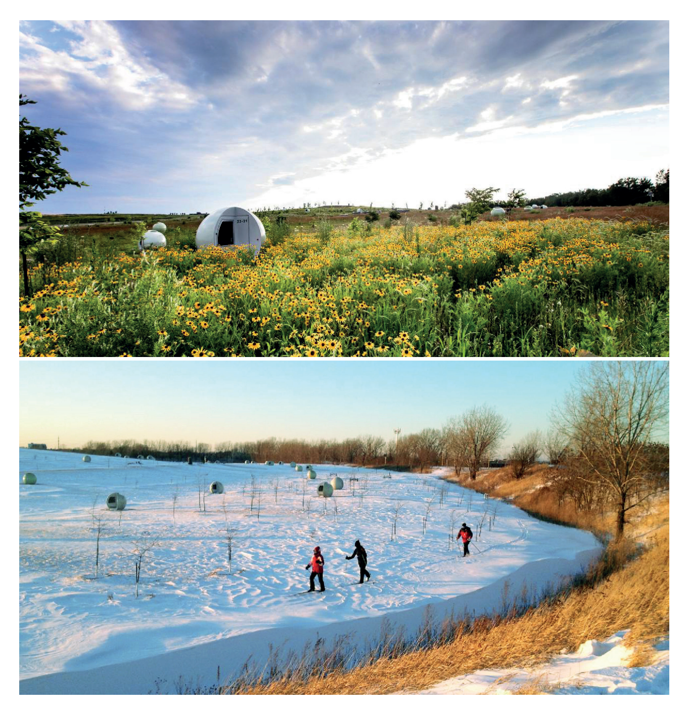
FIGURE 6: The Centre: open section to the public of the secluded wooded area during summer time (up) and winter time (down).