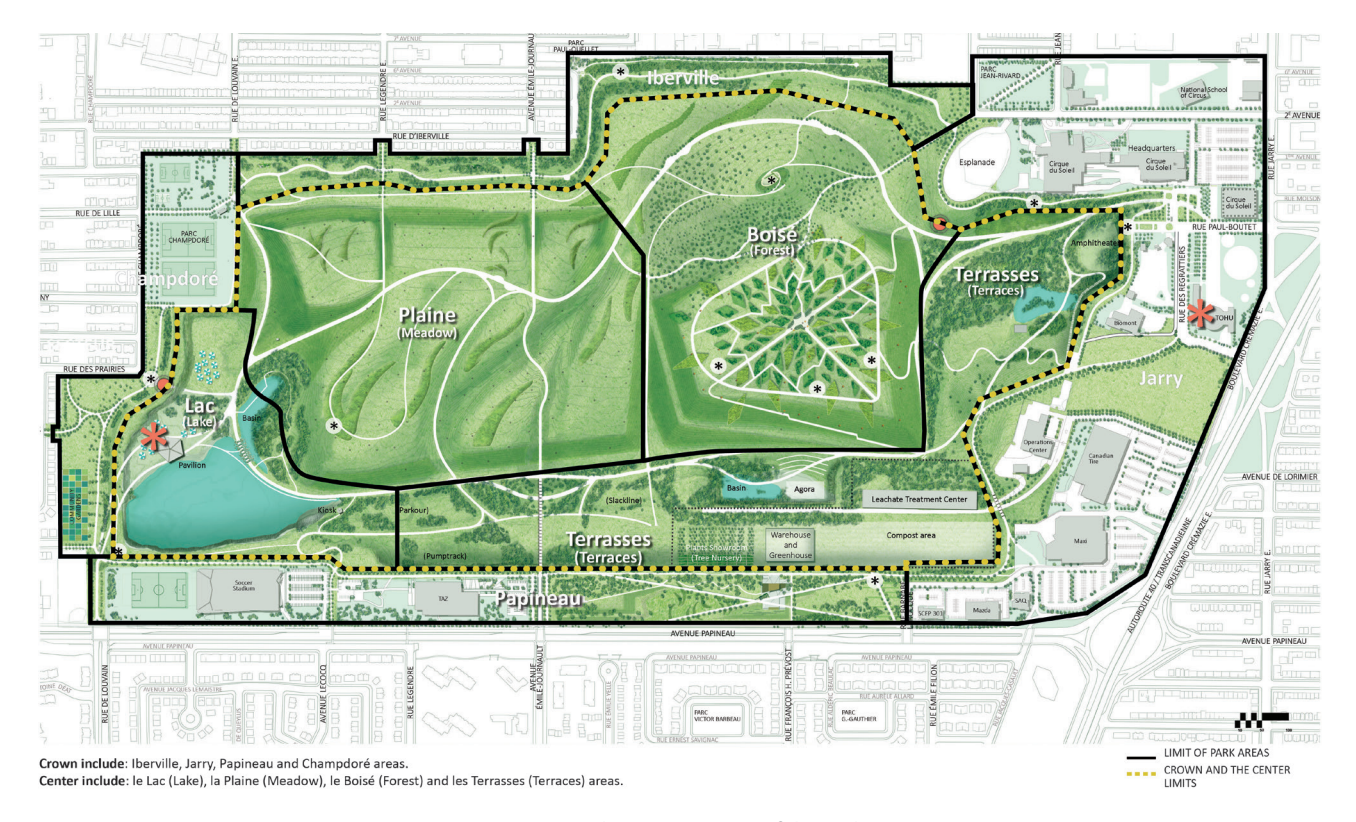
FIGURE 4: The various areas of the park.

The Crown, which has been opened to the public since 1995, encompasses the cultural, sports and industrial-com-