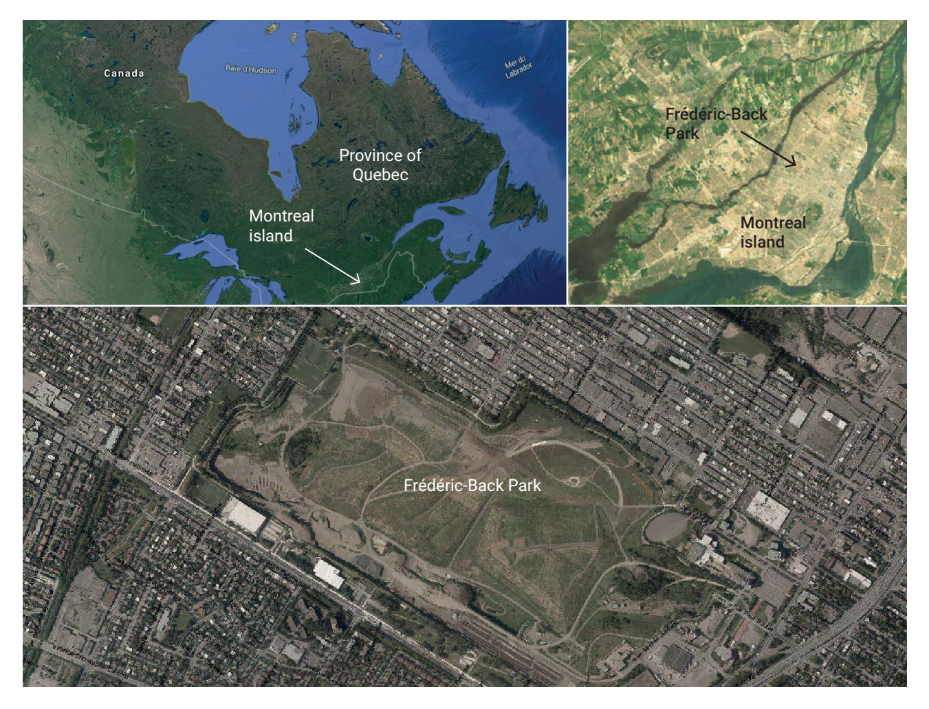
FIGURE 1: Frédéric-Back Park location in a densely populated area of Montreal, Province of Quebec, Canada.

This paper presents the steps of the metamorphosis of the landfill site into Frédéric-Back Park, since its take over by the City of Montreal. It first describes how it was made safe for the surrounding people and for the environment. Then it presents concepts and objectives behind its transformation into a park. It finally exposes the main actions taken to meet the needs of both past and future functions.