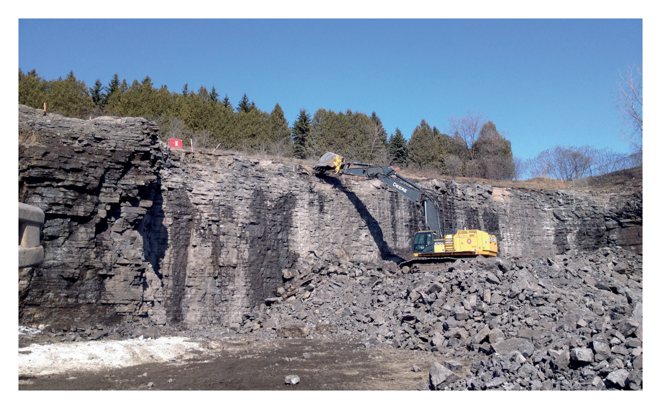
FIGURE 9: Securing the cliffs.