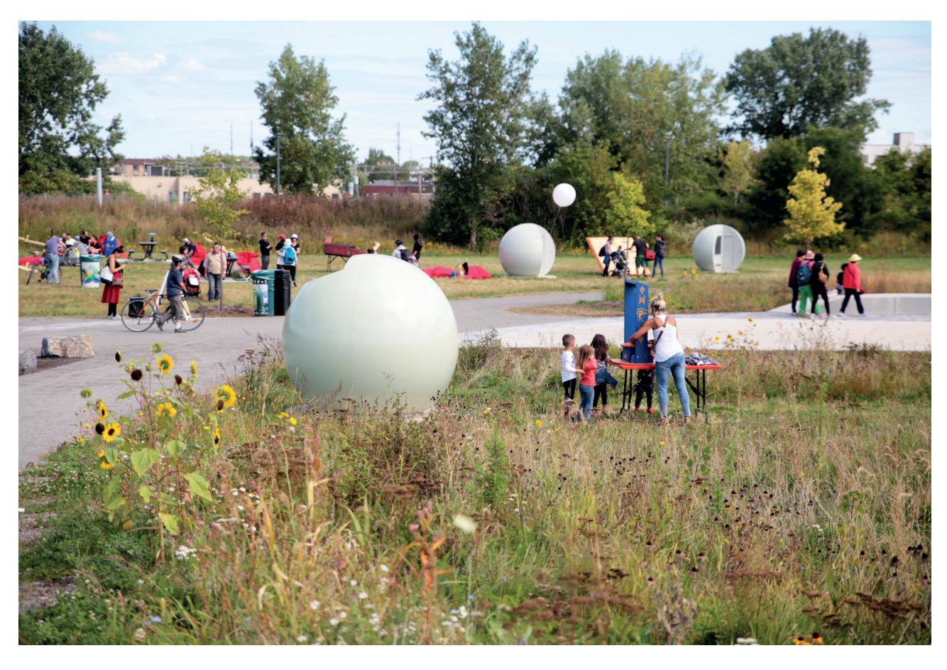
FIGURE 7: Various activities organized in the Frédéric-Back Park.

public while the buried waste is still decomposing and releasing LFG and leachate is a highly unusual endeavour. It has taken vision, perseverance, ingenuity and courage to develop this green space, as well as an exceptional collaboration between two municipal departments (parks and environment), with some support from the MELCC, experts from the private sector and specialized contractors.