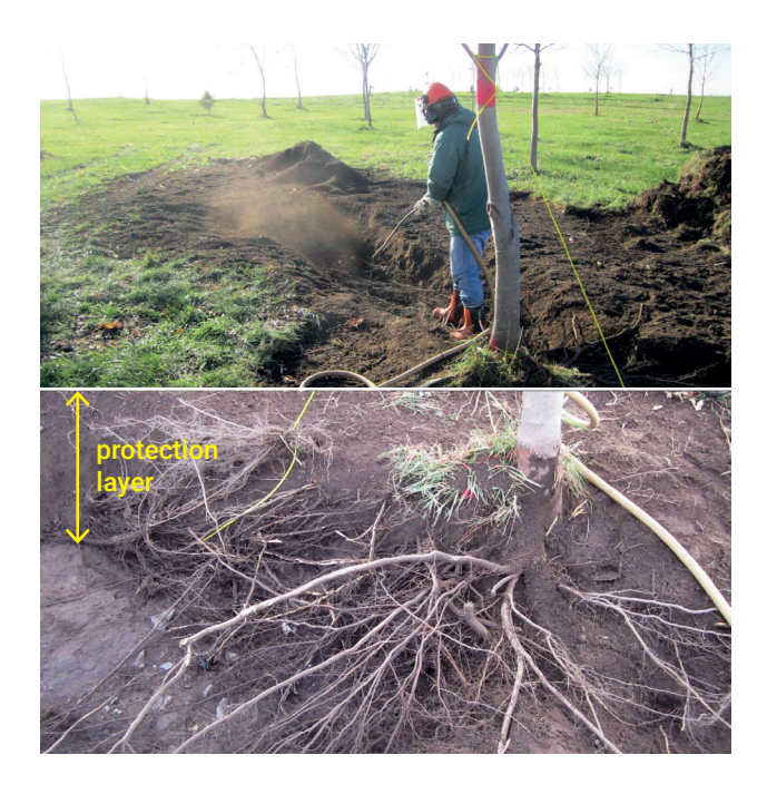
FIGURE 3: Root cleaning with a high-pressure air blow gun (up) and cleaned roots (down) in the protection layer.

Based on the theme of metamorphosis, the Master Plan focuses on three characteristics of the site: Vastness,