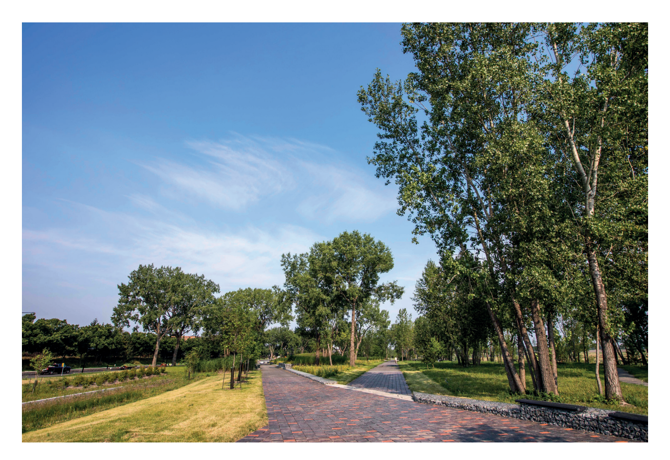
FIGURE 5: The Crown, sector Papineau.