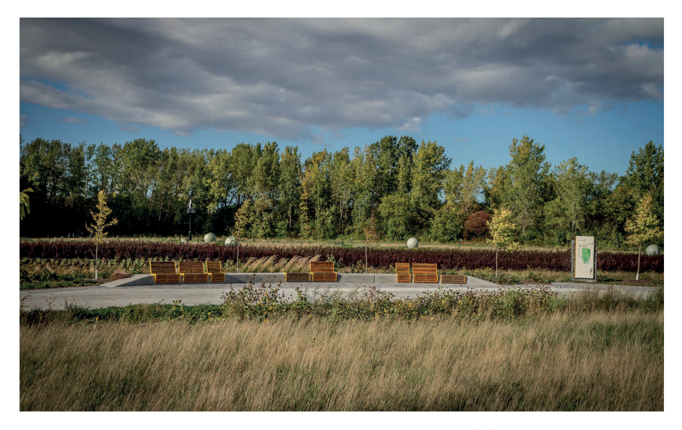
FIGURE 11: Ash trees attacked by the emerald ash borer being used for furniture.

The City of Montreal is in the process of converting a large landfill into the Frédéric-Back Park for the benefit of